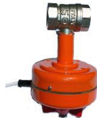
Figure 2. Prototype piezoelectric valve for a 1/2” pipe